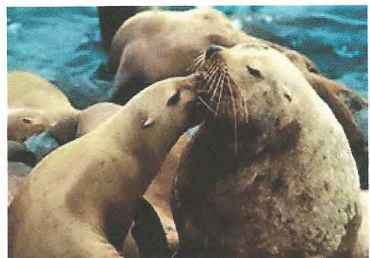
Stellar Sea Lions